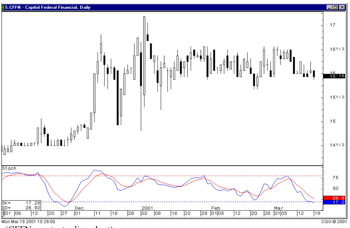
(CFFN – not a trading chart)